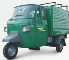
apé HIGH BODY

Widest Range in 3w Cargo Segment in India