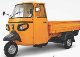
Ape Xtra LDX