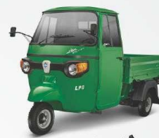
Ape City XTRA